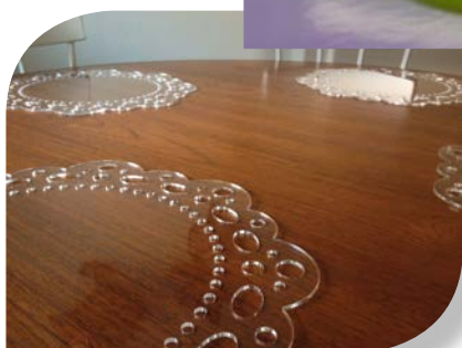
Clear or Branded Acrylic Placemats