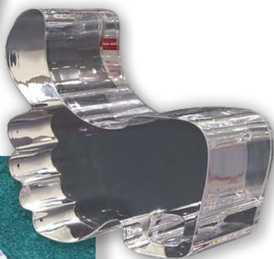
Top: Crystal Clear Thumbs-Up on 1" Acrylic